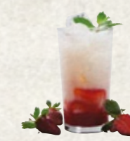
Kyoto Delight strawberry, calpis soda 48,0