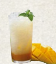
Tokyo Delight mango, calpis soda 48,0