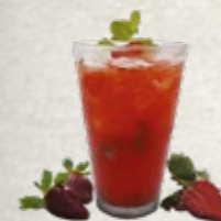
Maison Berry Fantasy strawberry, cranberry, passion fruit, lime, tea 48,0