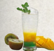
Hanabi Fizz mango, kiwi, soda 48,0