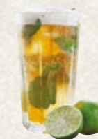
Niwa Tea Breeze elderflower, mojito mint, lemon, tea 48,0